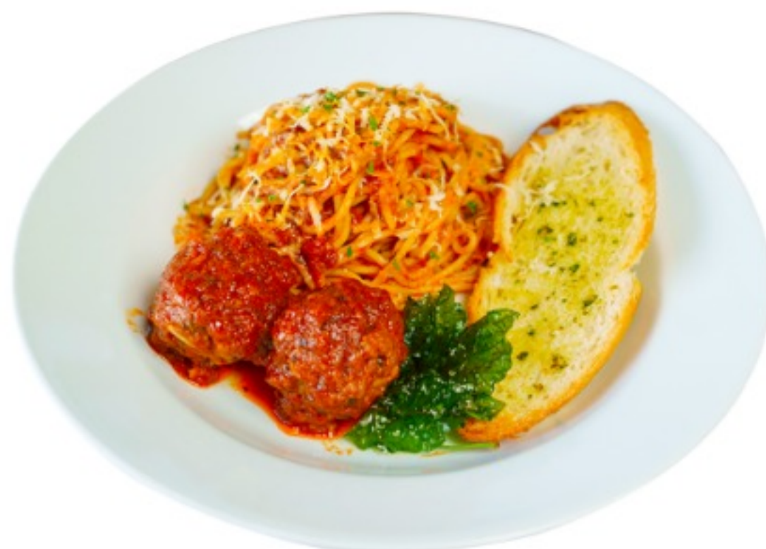
Pomodoro Pasta with Meatballs