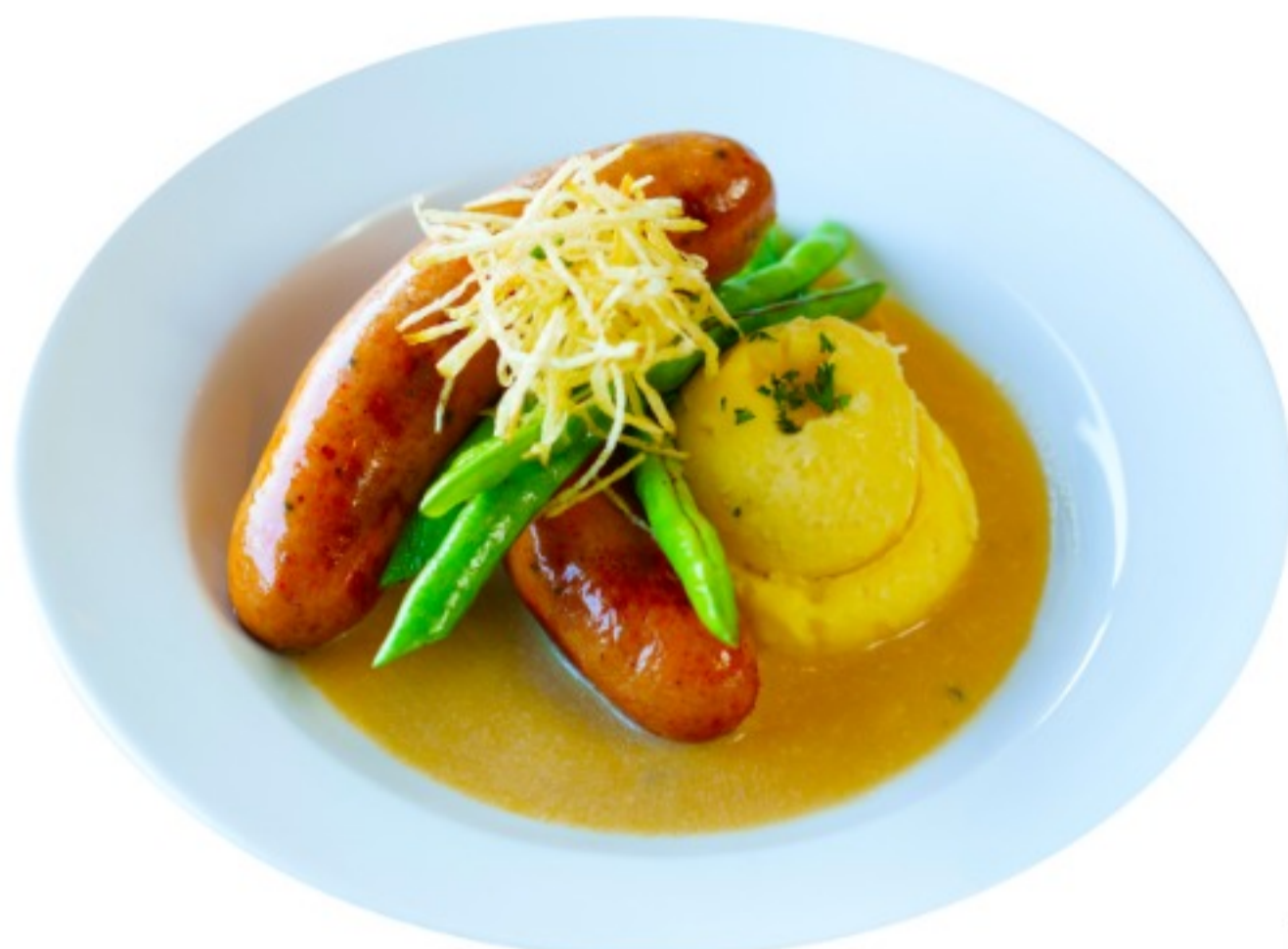
Grilled Hungarian Sausage