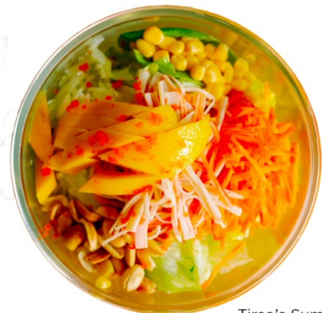
Tirso's Summer Wind