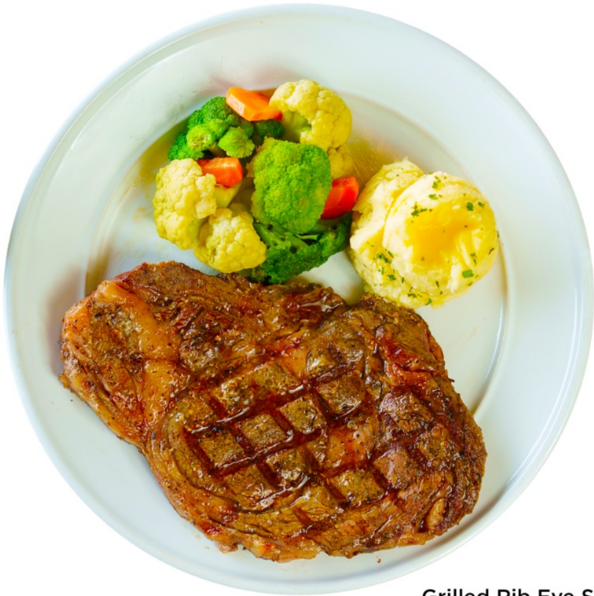
Grilled Rib Eye Steak

Tirso's Deli and Roasters, Double M Hotel G/F Double M Hotel, M.L Quezon Street, Poblacion, Valencia City 8709 Bukidnon, Philippines 0917 308 9243